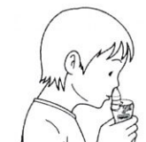
Using the Nosepiece (Option)