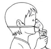
Using the Child Mask