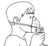
Using the Adult Mask