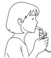
Using the Mouthpiece