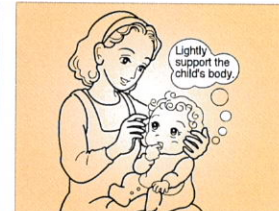
When infant sits up