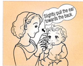
Measuring for a child