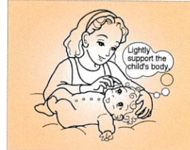
When infant is lying down