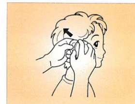
If the ear is too small to insert the probe: While slightly pulling the ear towards the back, insert probe without force so that it just cover the external auditory canal.